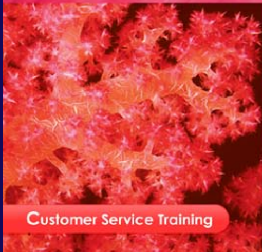
Customer Service Training